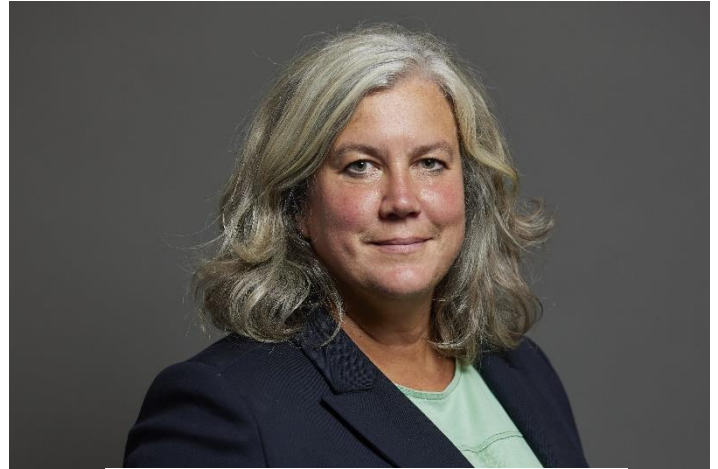
Heidi Alexander

Following Louise Hague's recent departure as Secretary of State for Transport, Sir Keir Starmer has appointed Heidi Alexander as the new Transport Minister.